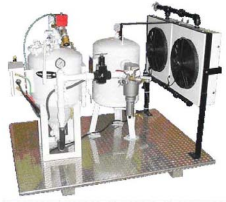
SB-200-SM Compressor Ready